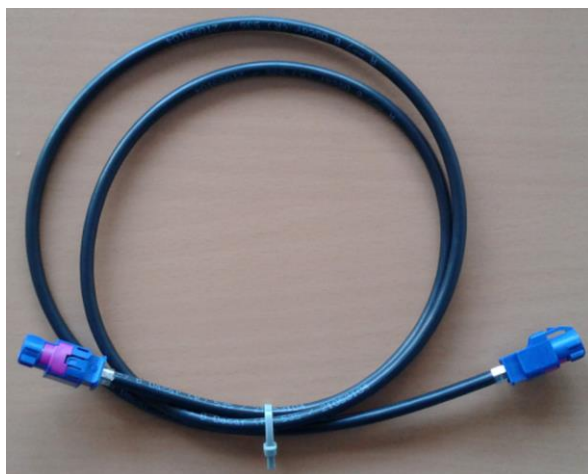
Figure 1-2: LVDS cable

Use the LVDS cable (see Figure 1-2) to connect the Frontend (connector 'a') to the CamHub (connector 'c') as shown in Figure 1-1. Different cable lengths are available on request.