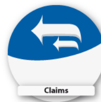
Figure 2-1: Download Evaluation Package