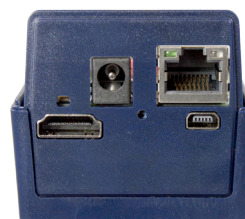
Argos 2D - A120 connector view